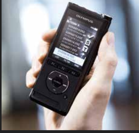
With the DS-9500, even when you're on the go, you can send your dictations over WiFi to your chosen email recipients.