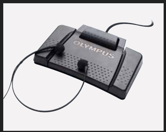
AS-9000 includes RS-31H, E-102, ODMS Transcription Module (Single License)